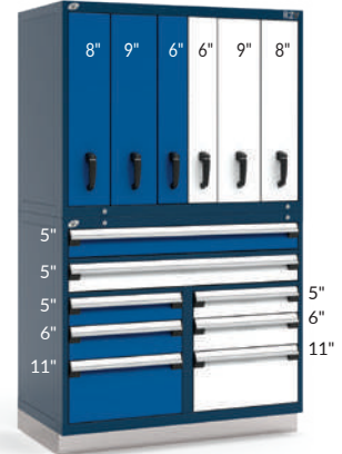
W x D x H 48" x 27" x 76" RL-XHG76D004NS