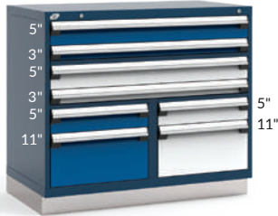
W x D x H 48" x 27" x 42" R6KHG-3802S