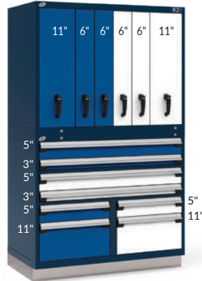
W x D x H 48" x 27" x 76" RL-XHG76D002NS