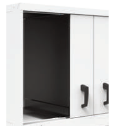
Security Panel (RL91)

For more information, contact our representative: