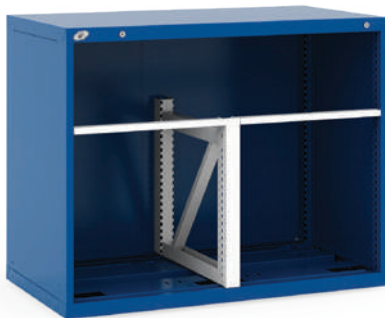
Multi-Drawer Housing for Two Users (RA34, RA45 + RA46)