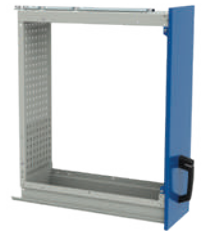
Vertical Drawer (RL31)