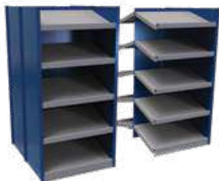
SRE2T-EE751001B Starter unit