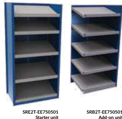
SRE2T-EE750501 Starter unit