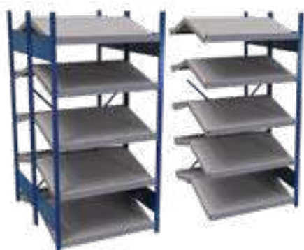
SRE1T-EE751001B Starter unit