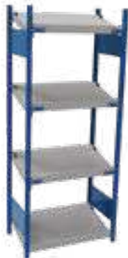
SRK1F-DC750401 Standalone Unit