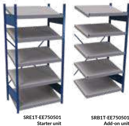
SRE1T-EE750501 Starter unit