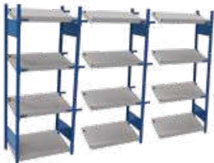
SRE1F-DC75041 Starter unit SRB1F-DC750401 Add-on unit SRG1F-DC750401 End unit