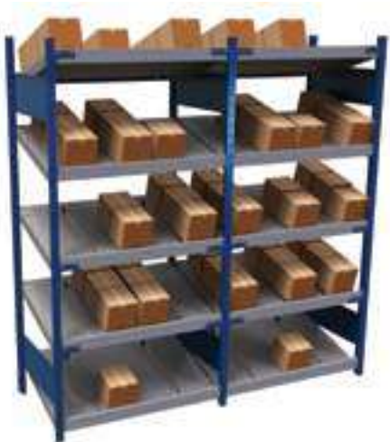
SRE1F-EE750501 + SRG1F-EE750501

Rousseau shelving with sloped shelves provides superior-quality gravity flow storage that integrates perfectly with other products in our Spider® range. This unique product on the market is available in a wide range of dimensions to fulfill your exact requirements. With an average slope of 15 degrees, sloped shelves are perfect for rear-loading applications (flow rack). These units help to create a "first in, first out" (FIFO) system. Shelving units without rear access are also available for more conventional storage. Sloped shelves provide optimum visibility for items stored on shelves above the user's eye level. For shelves below this level, the extra angle reduces visibility of the shelf contents. If visibility is more important than flow in your system, we recommend installing lower shelves at right angles (SH20 / 21).